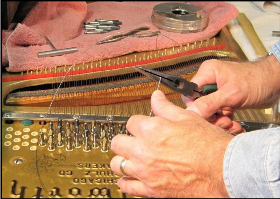
Work in progress on a restringing / repinning job.

"In business to bring your piano to its full potential."