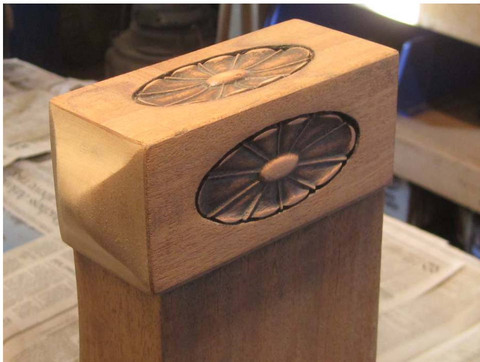
Photo 23: The original beauty of the case is starting to come to light.

Next step – Veneer repair and staining the case parts are next on the to-do list.