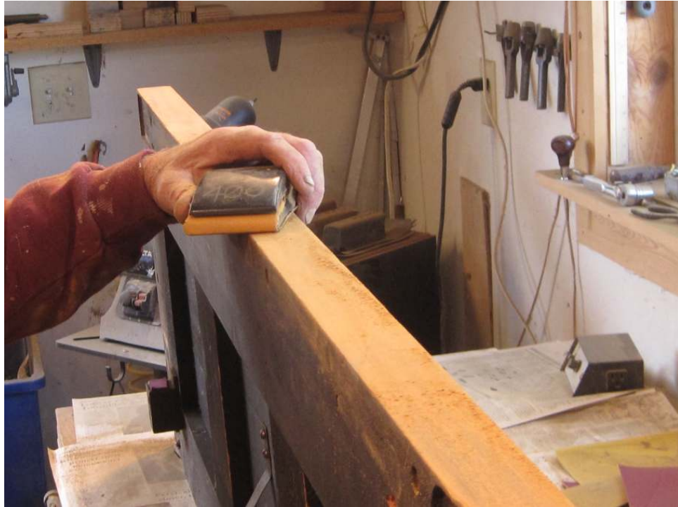
Photo 20: Once everything is stripped and allowed to dry, sanding begins.