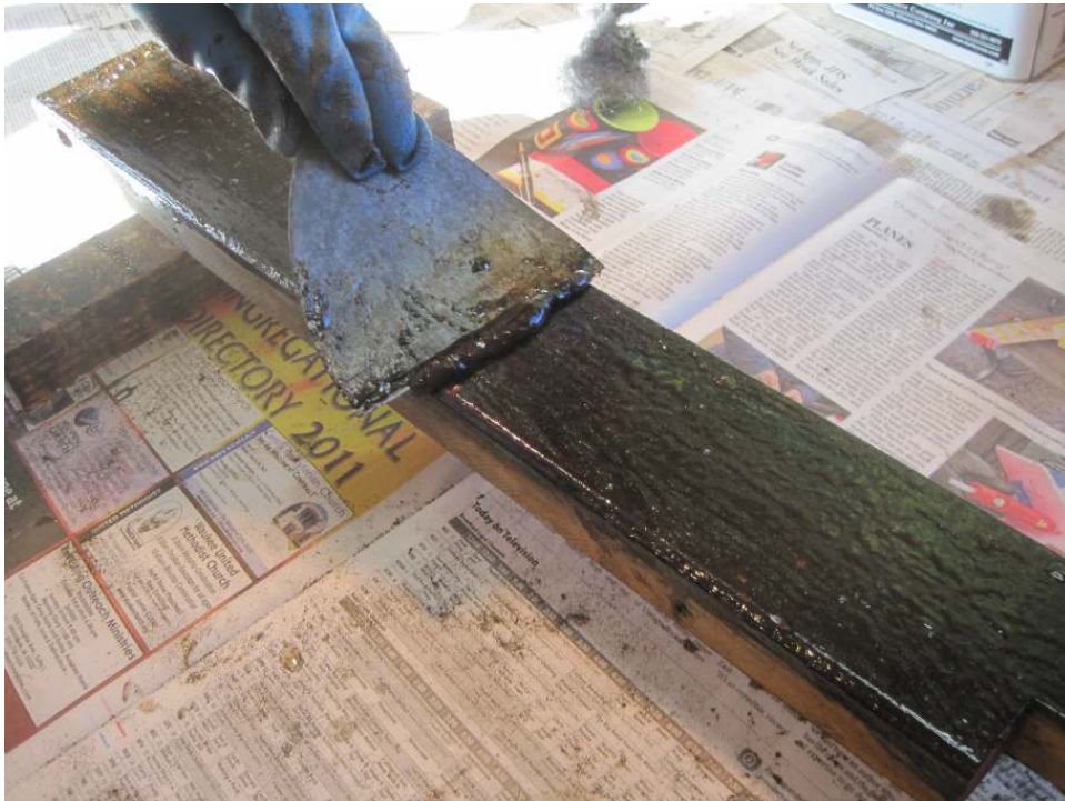
Photo 15: After several minutes a putty knife is used to remove as much goop as will come off. The finish on this piano is stubborn and takes 3 coats of stripper to do the job.