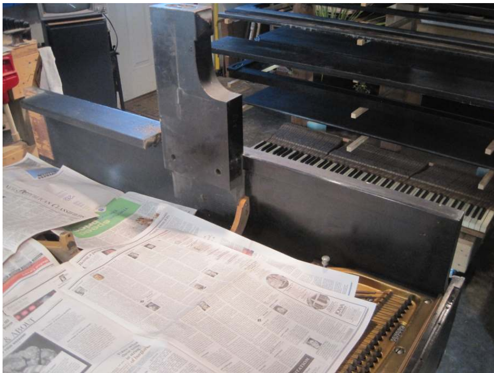
Photo 13: The glue joints attaching the arms to the sides are solid. The arms stay attached.