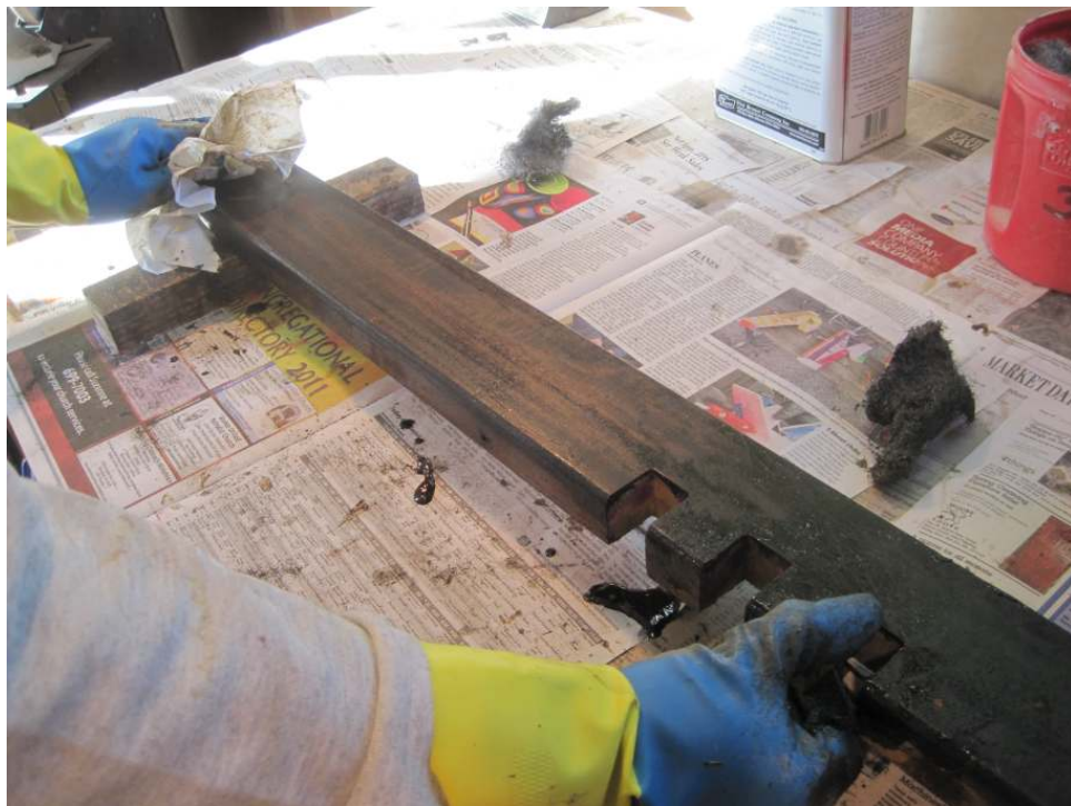
Photo 17: Coarse steel wool and plenty of paper towels complete the stripping.