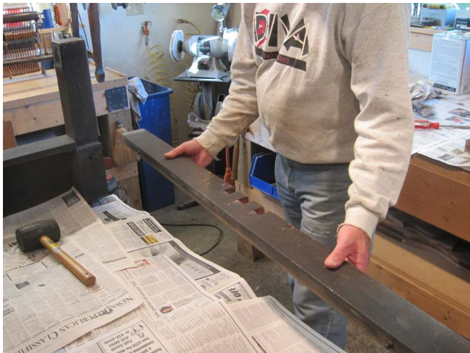
Photo 9: Each case part removed makes the refinishing work simpler.