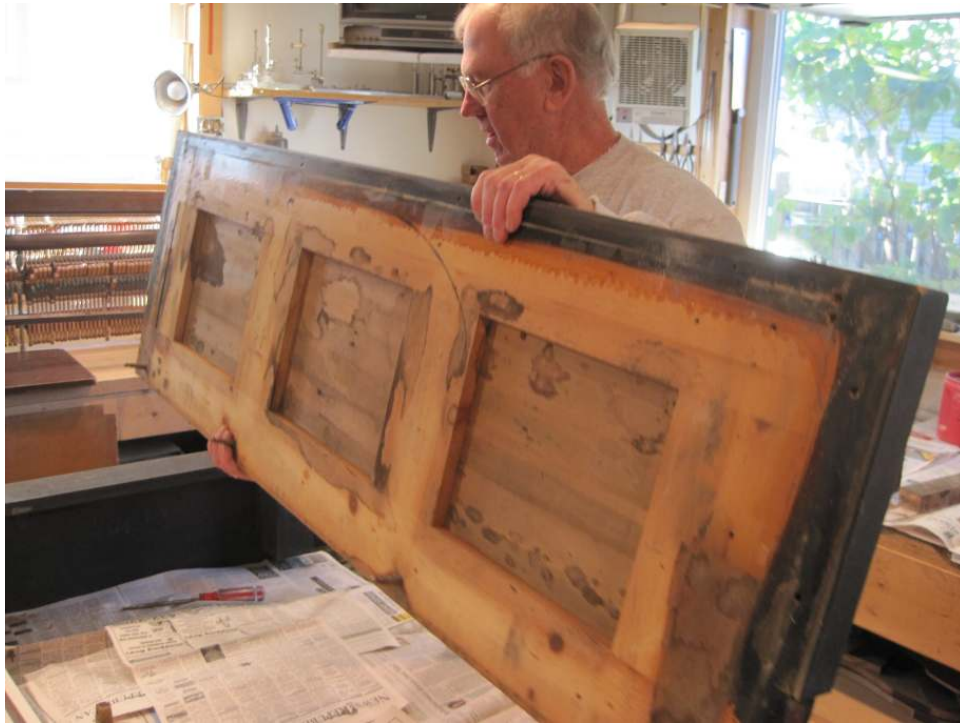
Photo 12: The keybed is the last part to take off. The teardown is now complete.