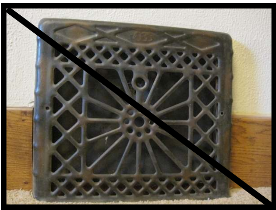
1. Hot air registers—dry, heated air blowing directly on the back of a piano is particularly bad for the soundboard.

Environment: While tuning, repairs, regulation and voicing are the job of the technician, seeing to it that your upright piano is placed in an appropriate spot within your home is up to you. What is needed, as much as possible, is a location where temperature and humidity are kept at moderate levels year-round. Drafty locations, or areas where wide swings in either temperature or humidity occur (unheated porches, moldy basements, etc.) are unsuitable for a piano. In particular avoid placing your piano in front of either of the following: