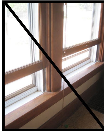
2. Drafty windows.

Note: Effective humidity control equipment, either for the home in general or the piano in particular, will aid in keeping your piano in top form.