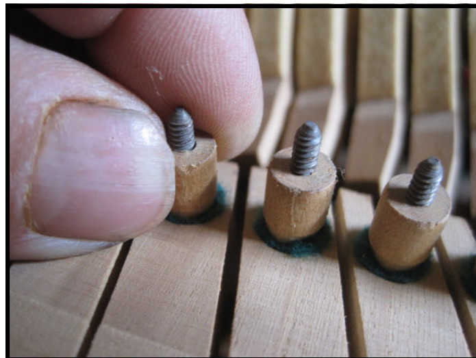
Adjusting lost motion with a fine touch.

At present, your piano is in need of adjustment as far as lost motion is concerned. Having the adjustment set correctly would improve the consistency of the touch of your instrument.