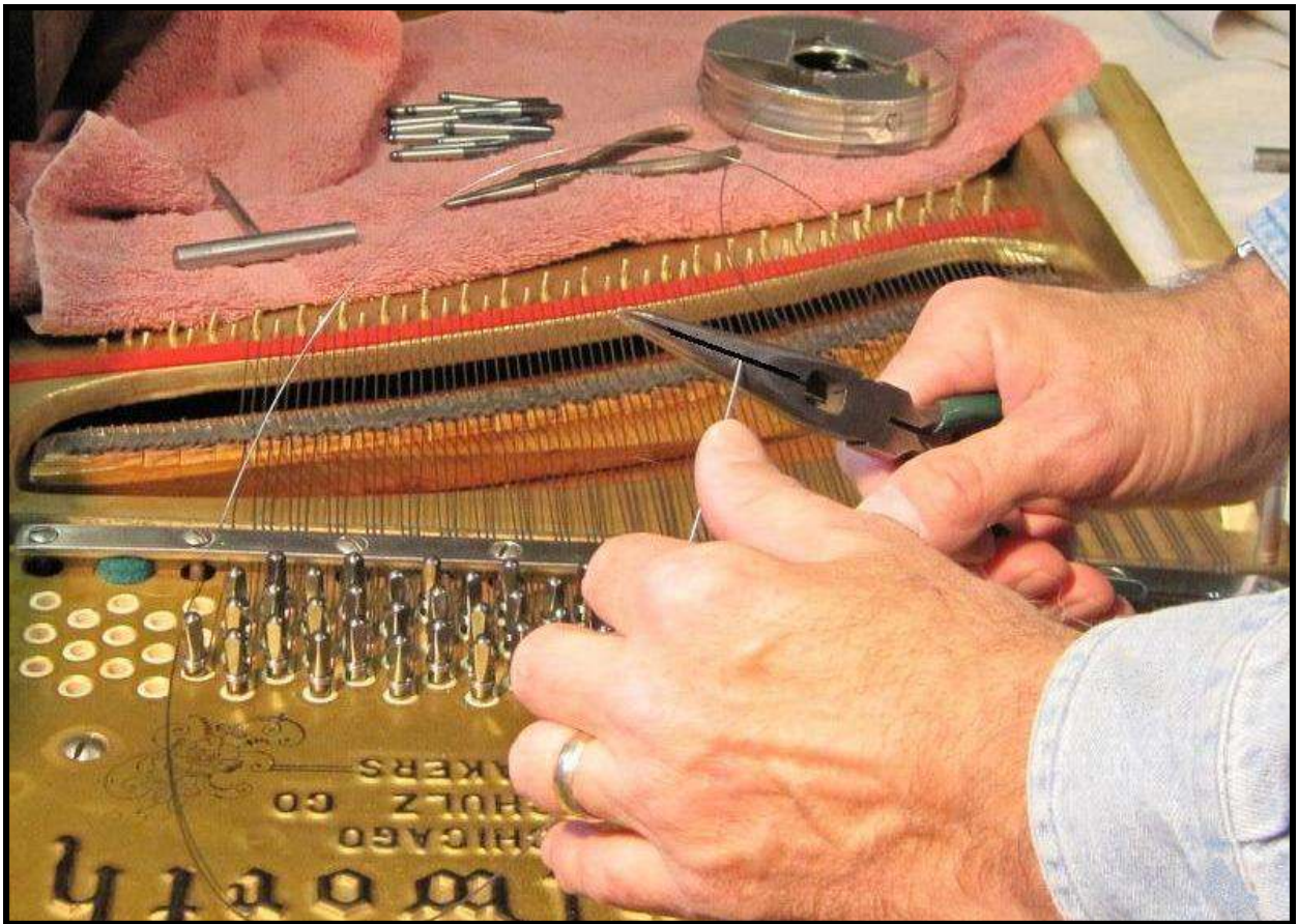
Work in progress on a restringing / repinning job.

"In business to bring your piano to its full potential."