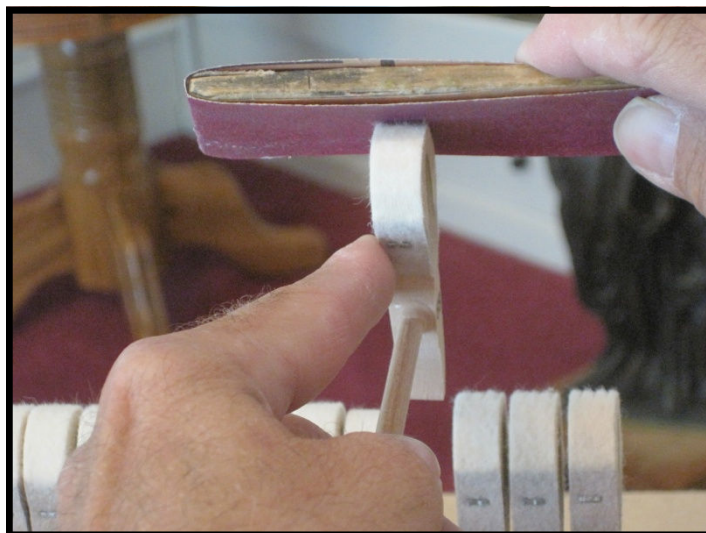
Hammers being filed to remove cut marks.

Repairs: Your grand piano action has thousands of individual parts, and after decades of use, breakage may occur or parts may simply wear out. The good news is that most of the parts found in a grand piano action (the working mechanism) do not often break and those parts that do happen to break or wear out commonly may be either replaced with parts available to the professional piano technician, or repaired to like-new condition.