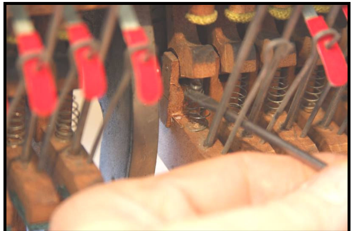
A very tricky operation getting the parts to fit snug..

To properly do this job, it would make sense to transport the piano action to the workshop. While the action was in the shop, any other work which the action needs to have done could be attended to as well if so desired.