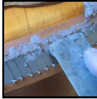
Split-out holes are filled.

Fortunately, when the splitting is not too severe, an on-the-spot remedy is often possible by the use of a heavy paste epoxy to fill in the damaged area. Oftentimes, if enough time is allowed for, this repair may be made on the same day that the piano is tuned. The bass bridge pins of your piano are loose to the point where it is affecting the tone of the piano. To make epoxy repairs to the bass bridge of your piano, extra time will need to be scheduled ahead of your tuning appointment.