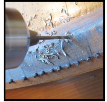
New holes are drilled.

With the bass strings temporarily removed from the bridge and bundled out of the way, the loose bridge pins will be pulled out completely so that the epoxy filler may be used. This epoxy cures rapidly as a result of the chemical reaction to the two components that are mixed together on the spot. Within a short amount of time, the hardened epoxy is ready to sand and drill for the reinsertion of the bridge pins.