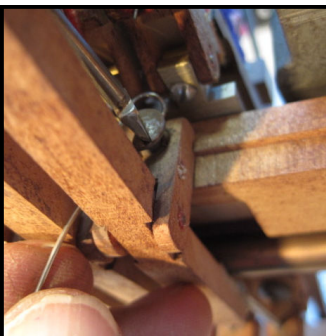
Hooked into place

To do this, the old damper springs are ordinarily clipped off at the base and a new set of springs are installed to take their place.