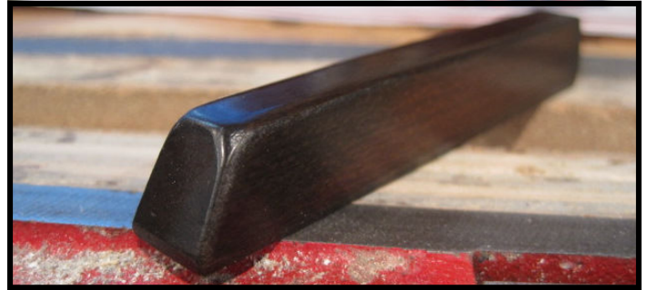
A vintage ebony sharp after stripping and polishing—the warmth of real wood.

The decision of whether it would be best to replace or restore your sharps keys depends largely upon the condition of the existing set on your piano.