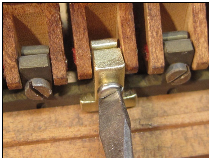
Repair clip for broken tongue being installed.

Individual butt plates may be replaced, but if more than a couple have broken the most practical repair may be to replace the complete set while the action is out of the piano. Once done this problem area will be taken care of for the foreseeable future.