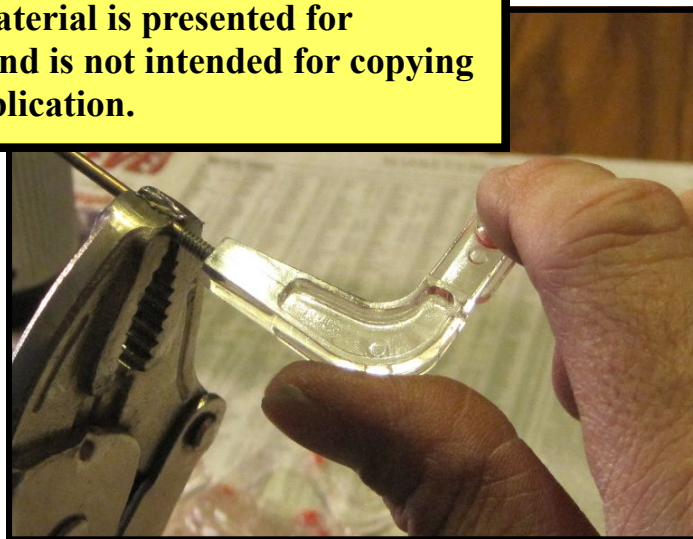
New plastic elbows being installed in a spinet.

Regulation: For your spinet piano to perform at its peak, the first step is to get it into tune and repair all broken or worn parts. When this has been done, the piano is ready to be "regulated." Regulation refers to the procedure of adjusting all the moving parts of the piano action so that the mechanism is performing in peak form, with no wasted motion. Because of the compact design of the spinet piano, it is particularly important that the piano is adjusted to perform at its best. Just as a small car is more enjoyable to drive when it is running correctly, a small piano will be more satisfying to play when correctly regulated.