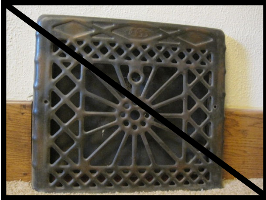
1. Hot air registers—dry, heated air blowing directly on the back of a piano is particularly bad for the soundboard

Environment: While tuning, repairs and regulation are the job of the technician, seeing to it that your spinet piano is placed in an appropriate spot within your home is up to you. What is needed, as much as possible, is a location where temperature and humidity are kept at moderate levels year-round. Drafty locations, or areas where wide swings in either temperature or humidity occur (unheated porches, moldy basements, etc.) are unsuitable for a piano. In particular avoid placing your piano in front of either of the following if at all possible: