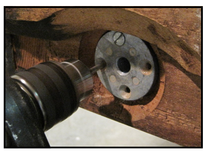
New socket being installed.

The casters on your piano are of this old steel variety, and as such could stand to be replaced. A new set of twin rubber-fiber casters would greatly improve the ease with which your piano could be moved.