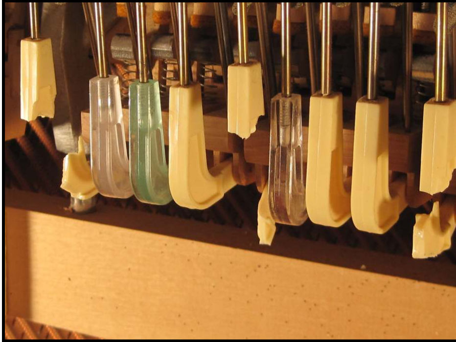
Breakage in progress.

Of course you may have me just replace the broken ones for now if that works best with your budget. The problem is that more elbows will undoubtedly break, usually at inopportune times, resulting in either yet another service call or in having to put up with notes which don't work until your next scheduled tuning.