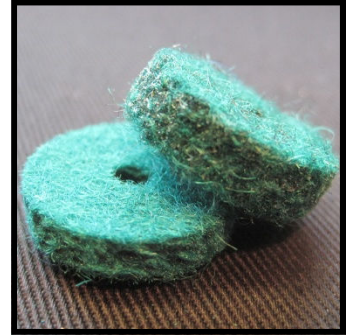
Front rail punchings

The felt used for backrail cloth, as well as the balance rail and front rail punchings, is a very thick, dense felt that is designed to stand up to decades of constant use.