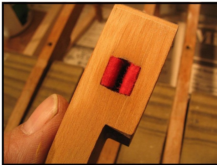
A key which has been professionally rebushed.

Functionality of the Parts: The wooden portion of the key (the "keystick") operates much as a child's teeter-totter. The center of each key rests on the balance rail, which serves as the fulcrum. Two polished "keypins" (front rail pin and balance rail pin) keep the key tracking in a straight line. Felt punchings (the green and white felts in the photos above) cushion the keys from underneath, and felt bushings (the red felts in both photos) help to make sure that each key has a snug fit and is silent in its operation.