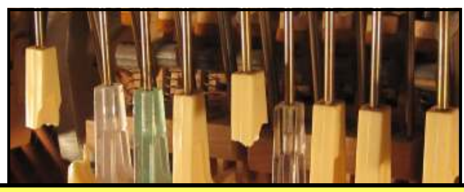
PREVIEW COPY ONLY

If your piano has just a few broken elbows, you may of course have me just replace the broken ones for now if that works best with your budget. The problem is that more elbows will undoubtedly break, usually at inopportune times, resulting in either yet another service call or in having to put up with notes which don't work until your next scheduled tuning.