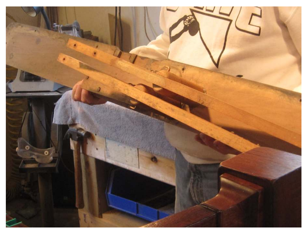
Photo 48: The floor of the piano with the attached pedal trapwork is due for a cleaning before being reinstalled in the piano.