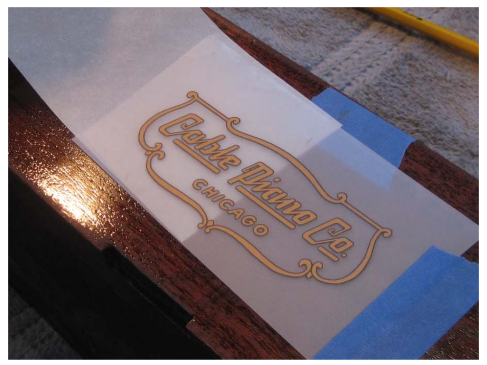
Photo 38: Once the decal is taped on the right hand side, the protective tissue is slid out. Only <u>once</u> have we actually burnished the decal to the tissue.