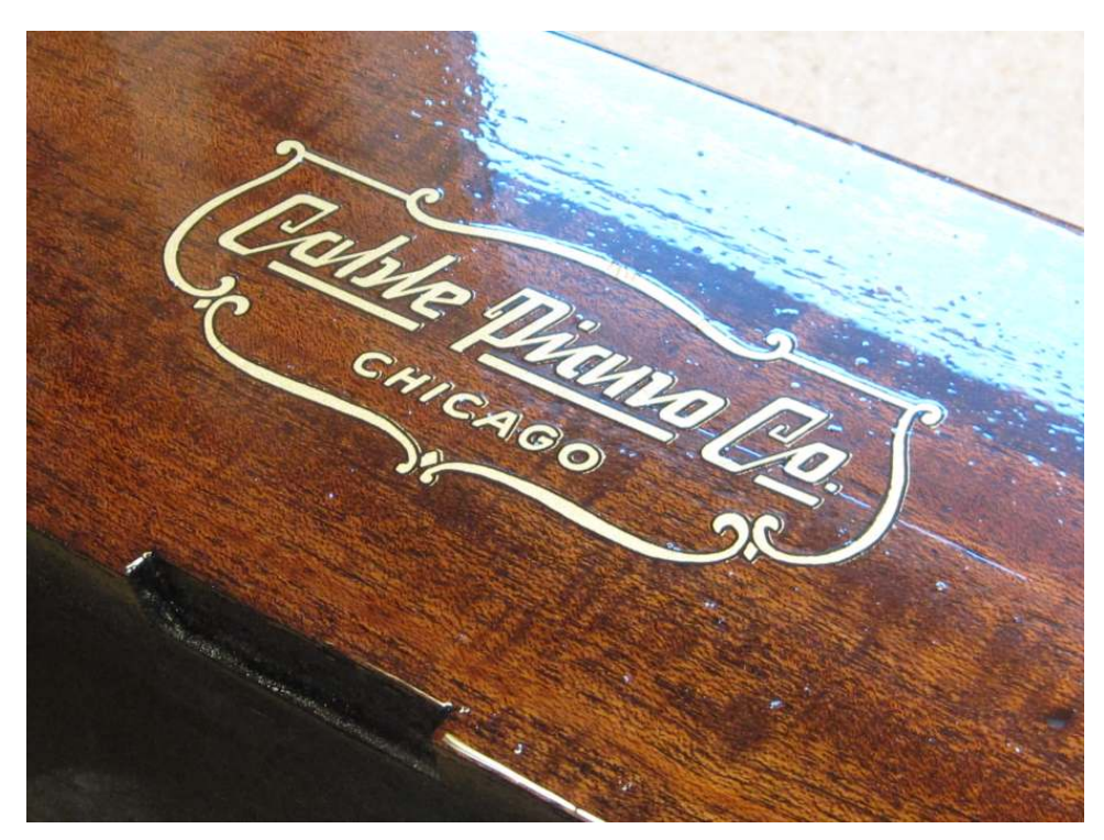
Photo 41: Once the polyurethane has dried, the decal will be protected. One final topcoat will seal the deal for the fallboard.