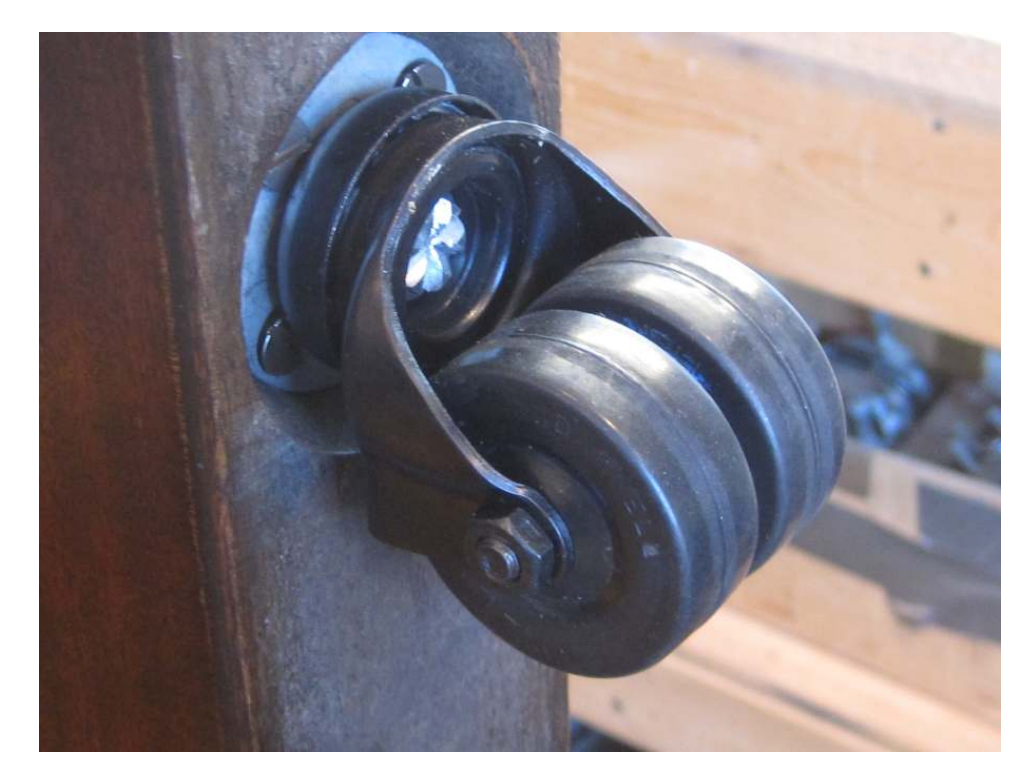
Photo 43: Time for new casters - top-of-the-line cast metal sockets and twin, rubber-fiber wheels are installed. These things are great – practically every upright that comes into our shop get a set. Rolling the piano around in the shop with these on is a breeze. Plus, these are just the thing for pianos going into homes with any kind of laminate flooring.