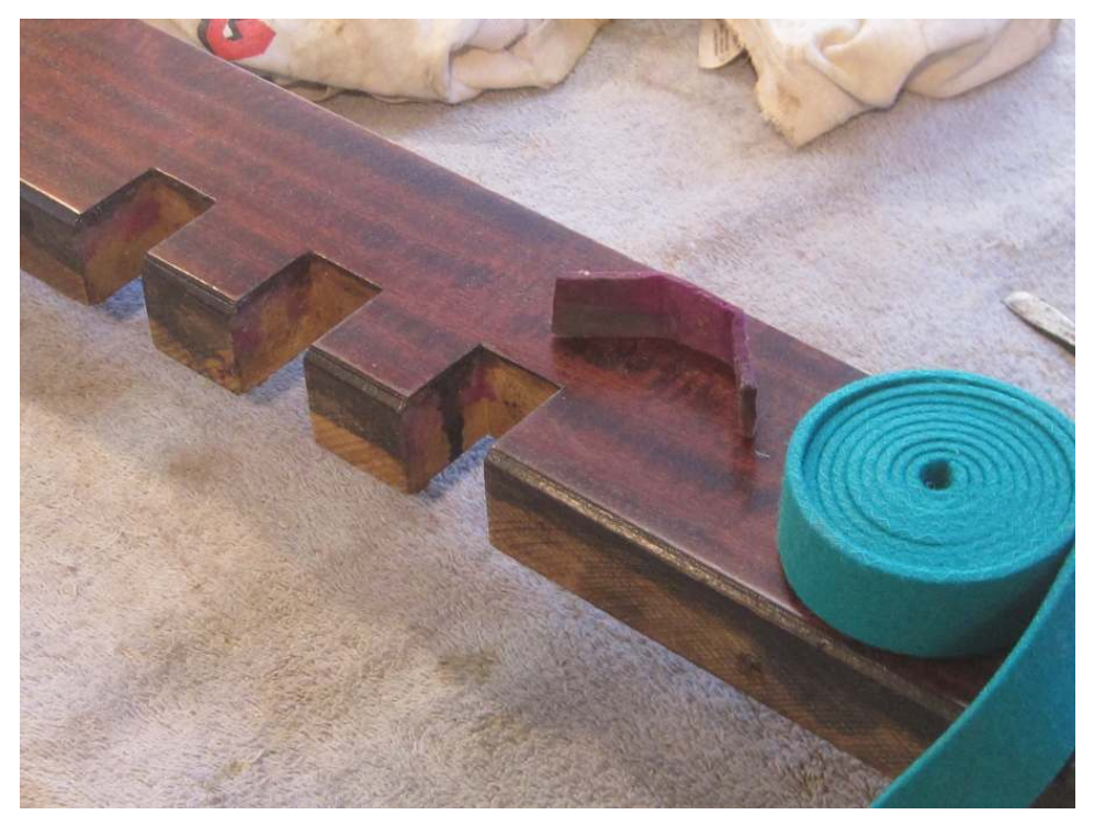
Photo 44: The pedal rail needs to be refelted. Dave chooses a felt with the same thickness as the old. Although purple felt is not an option we carry, the green will look quite nice.