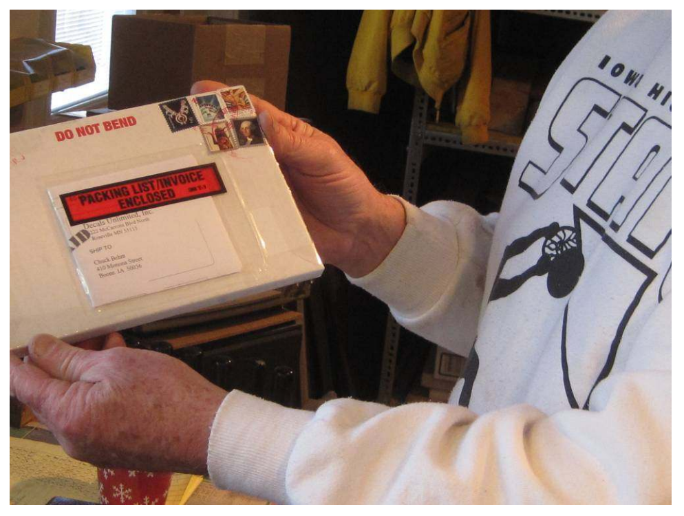
Photo 36: Christmas comes early. The new decal for the piano arrives from Decals Unlimited.