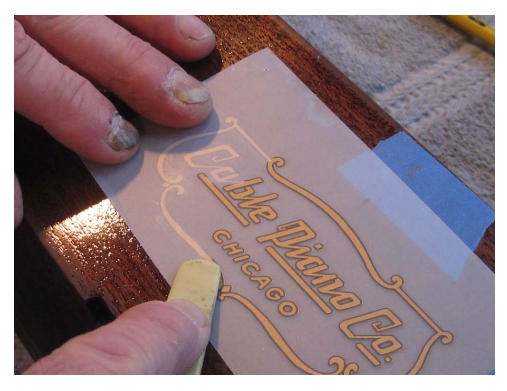
Photo 39: Using a burnishing tool, Dave works from left to right. As the transfer is made, the gold becomes hazier in appearance, showing that the decal is bonded to the fallboard, not the plastic sheet.