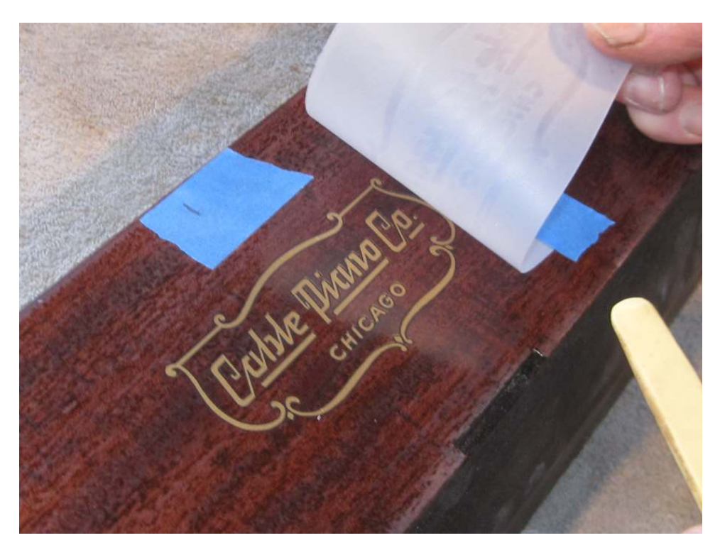
Photo 40: Dave lifts of the plastic sheet revealing the decal in place. (The slightly scuffed condition of the finish between coats improves adhesion.) Another coat of finish will be immediately applied to protect the new decal.