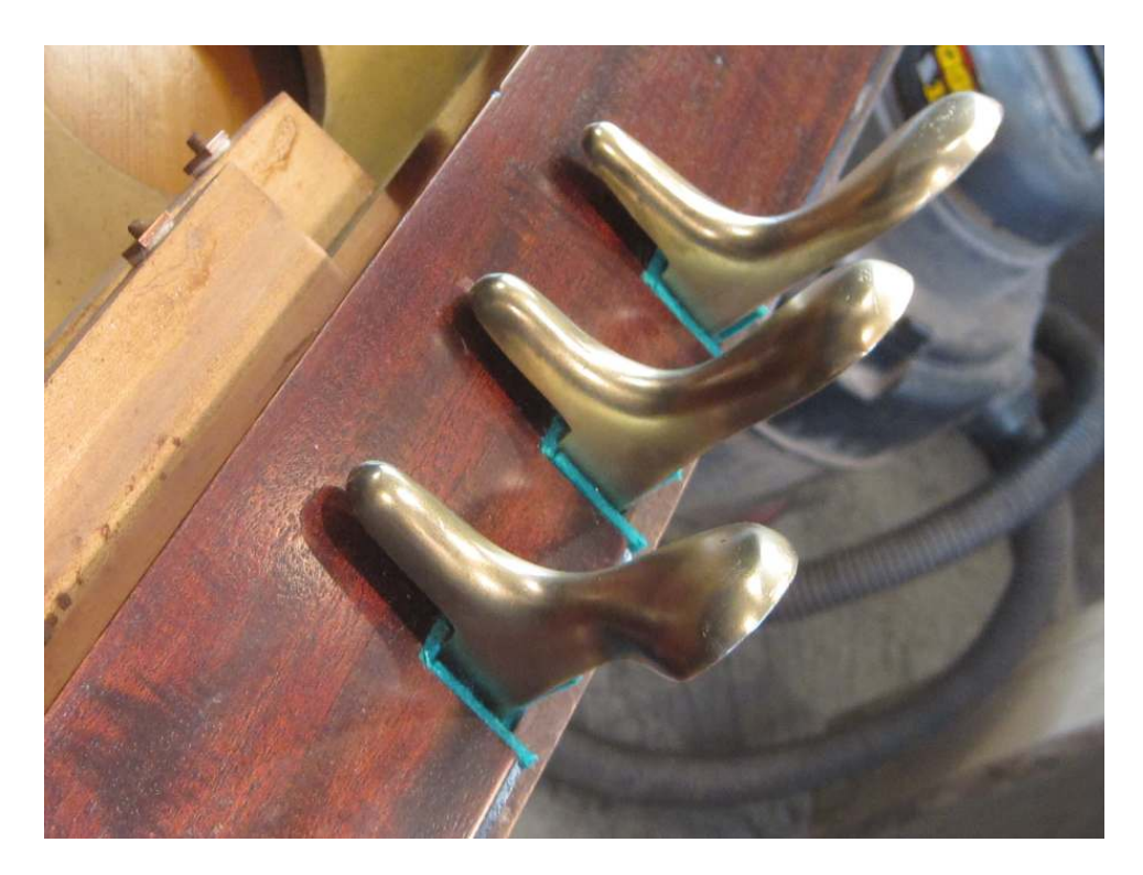
Photo 49: Pedals have been polished and lacquered. The floor of the piano and trapwork (after cleaning) has been reinstalled, along with the pedal rail with new felt. Things are starting to go back together.