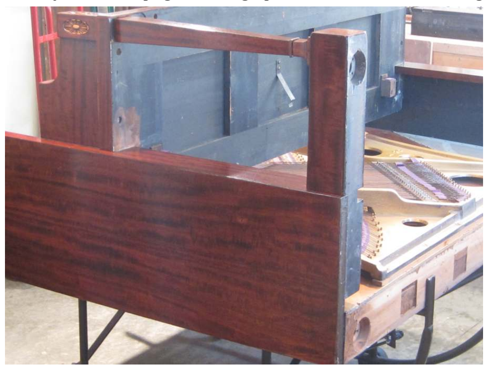
Photo 42: New casters need to be installed, plus the floor of the piano with the pedal assemblies needs to be returned before the piano may be put on its feet again.