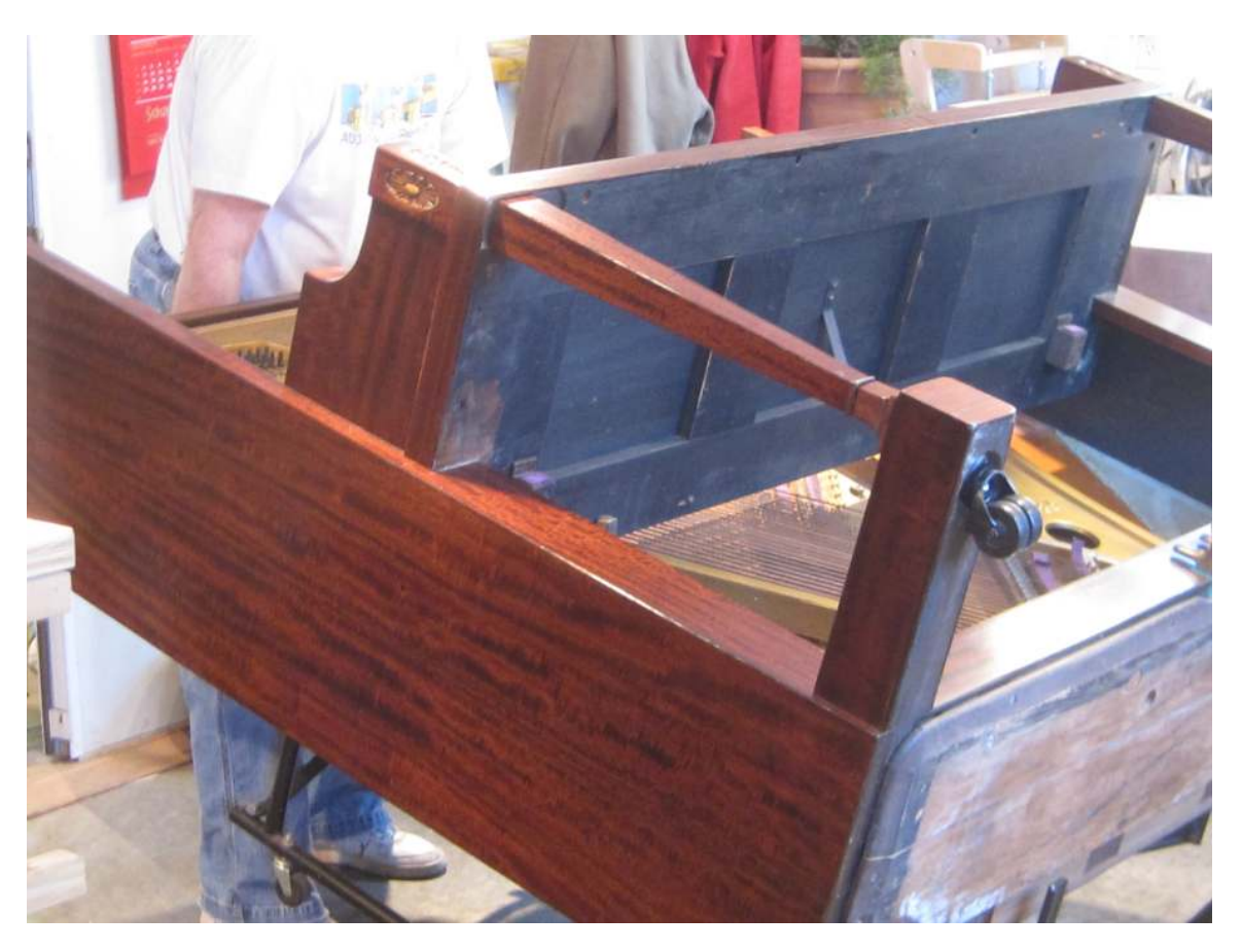
Photo 50: With the casters and floor installed, the piano is at last tilted back onto its feet.

Next up - The case will be reassembled in the finishing room of the shop. In the action repair room, work will proceed on both the keyset and the action. Special attention will be paid to the brass rails, as they have been a chronic problem area for the piano.