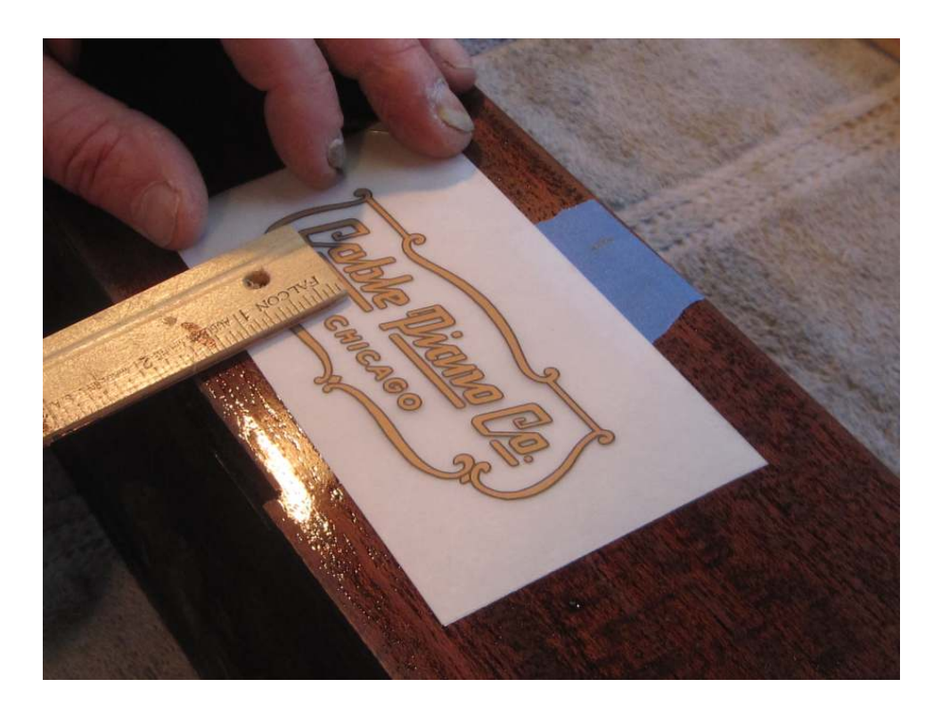
Photo 37: The decal is applied in between finish coats. Two coats of polyurethane have already been brushed on to the fallboard. After the decal is burnished in place, two more coats will be brushed on over it. Here Dave locates the decal at the center of the fallboard. The pencil line on the blue masking tape marks the center of the fallboard from side-to-side.