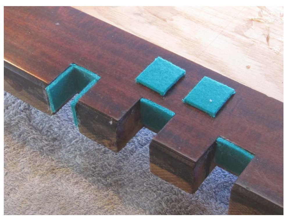
Photo 46: The felts are glued in place with Titebond. The top square goes in first, with the side felts put in to support the top.