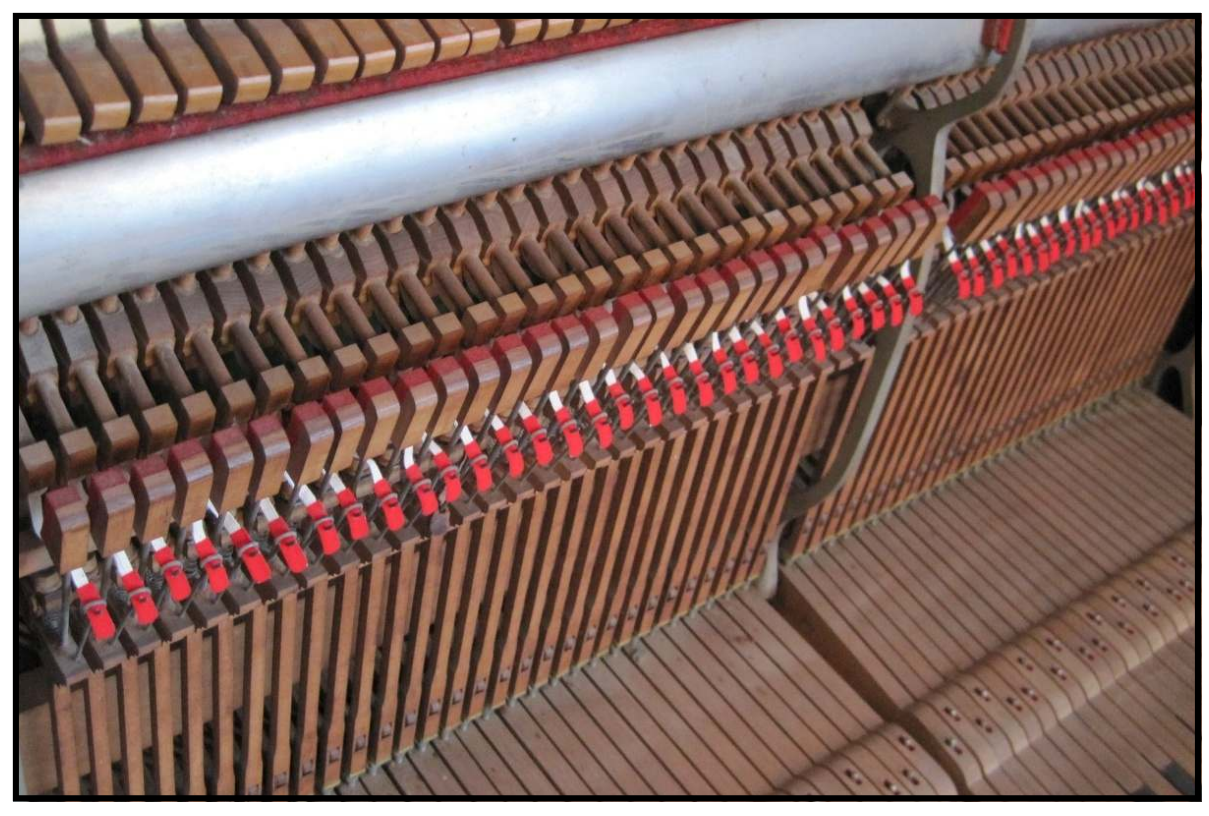
A newly repaired upright piano action, installed and ready for regulation..