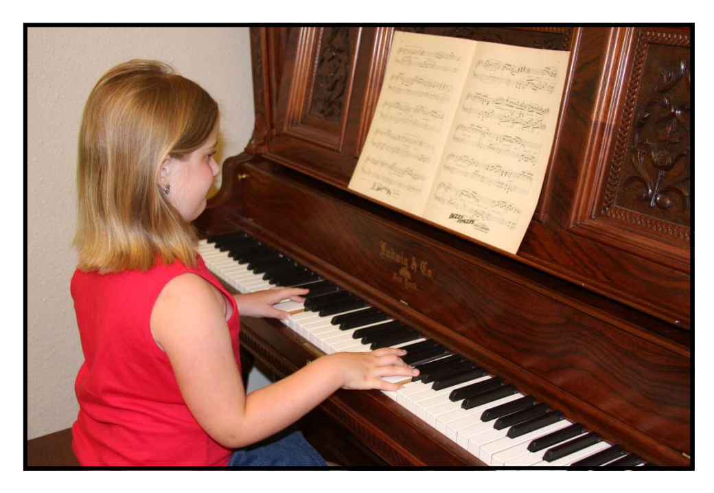
Sitting down to play on a freshly tuned upright piano is a wonderful experience for performers of all ages and ability levels!

<u>As an owner of a vintage, upright piano you have the privilege of play-</u> ing music on an instrument that was built around the same time that the first <u>Model T Fords were roaming the countryside!</u> With proper maintenance, upright pianos a century old or even older may be enjoyed daily, and have the potential to perform and sound as beautiful as the day they were built. "Planned obsolescence" was definitely not an idea that had occurred to the builders of these wonderful instruments! They were built to last!