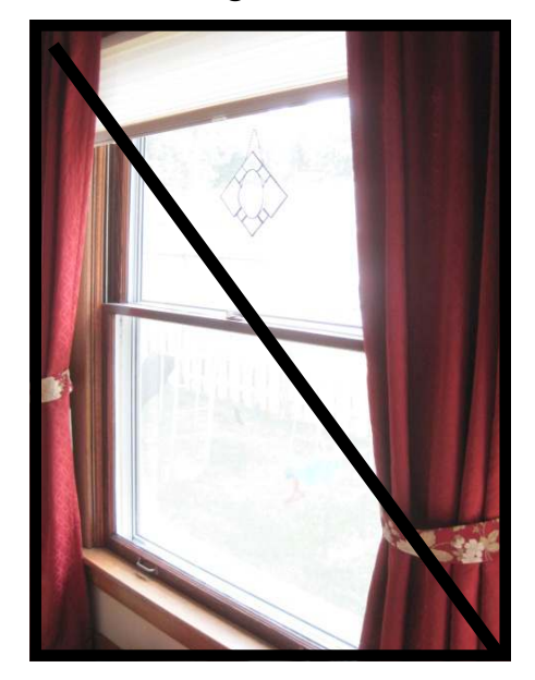
2. Sun-drenched southern exposures again very hard on the piano.

Note: Effective humidity control equipment, either for the home in general or the piano in particular, will aid in keeping your piano in top form.