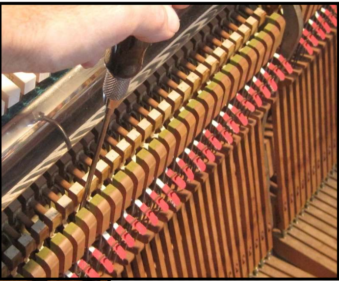
An unwanted quantity in the operation of the piano action is "lost motion," or wasted energy. In the photo to the left, lost motion is being taken up by the careful regulation of brass capstans.

Perfectly level keytops give an upright piano more of a "new" feel when played, and are essential for a piano to look its best. In this photo, a set of upright keys is adjusted to a tolerance of .002 ".