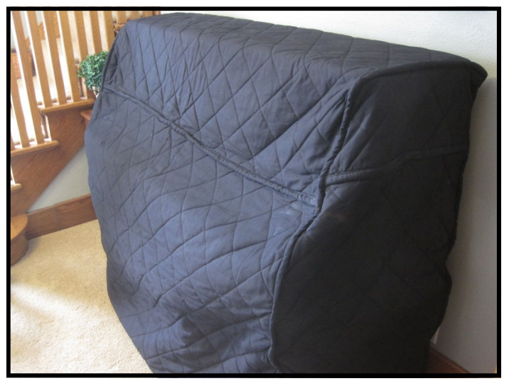
A heavy padded cover protects the best.

For providing effective protection, an unpadded or padded piano cover may be the ideal solution—a way to take away the appeal of keys to bang on, while at the same time cushioning any unsupervised activity to protect the finish, keys and action.