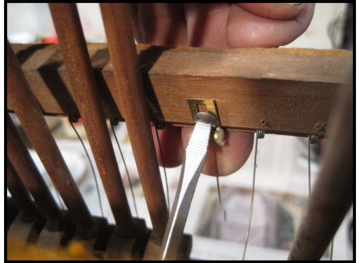
A hammer butt repair spring being installed.

For an on-the-spot replacement, a hammer butt repair spring may be used to replace a broken spring. The repair spring has a brass clip that may be screwed onto the hammer spring rail, as shown in the photo at the top of the next column.