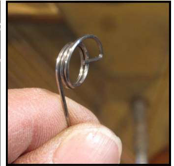
Making a new coil.

After a universal string with the correct core wire diameter and copper winding size is selected, the extra winding will be removed to match the length of the winding on the original string. (Universal strings come with a hexagon steel core wire which will firmly grip the end of the copper winding to prevent further unraveling.) A new coil will then be put on the end of the replacement wire and the wire will be installed in the place of the missing string, as in the photo below.