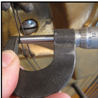
Miking the core wire.

When a bass string breaks in a piano, the correct repair is to either tie the broken string or replace it. When it's not repaired on the spot, time has a habit of slipping away, and it may never get fixed (witness the note on the plate in the photo—the string wouldn't be replaced for 68 more years!) Since there are broken / missing strings in the bass of your piano, one answer is to fill in for the strings that are missing with "universal" bass strings. Exacting measurements of the wire sizes of the existing neighboring strings will be taken to ensure a correct match.