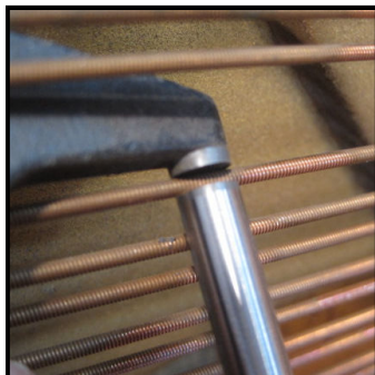
Miking the copper winding.