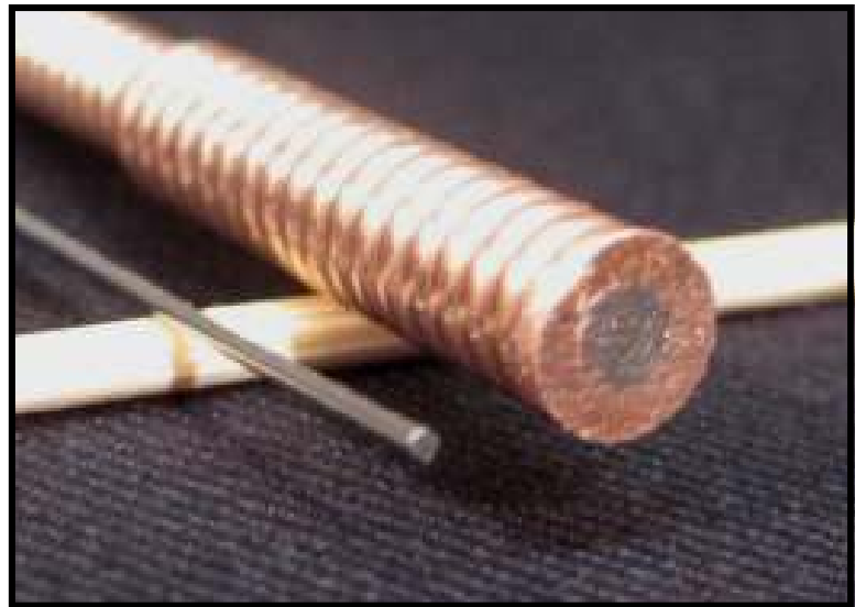
Cross sections of wires used for the highest and lowest note on the piano (balanced on a toothpick).

The sustaining power of the lowest notes of the piano is remarkable when compared to the very brief vibration made by the highest notes with their much lighter strings.