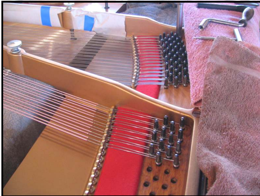
Installation of a new set of bass stings in progress.

One characteristic which all great-sounding pianos have in common is that they possess a rich, vibrant bass. A strong, resonant bass brings the music played on a piano to life. Unfortunately, as an instrument ages the bass strings which give the piano its musical heartbeat tend to deteriorate. Gradually, over the decades, the tone of the typical acoustic piano loses some of its original luster, and the instrument may come to have a bass sound which is "tubby" and not strong and vibrant. At this point, replacement of the factory-installed bass strings is in order. The bass section of your piano has gotten to the point where it would benefit tonally from the installation of a new set of bass strings.