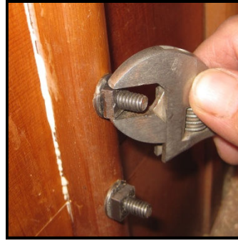
Toggle being tightened

One effective method of fixing the problem is to insert soundboard toggles to serve as clamps so that the ribs may be properly reglued to the soundboard. This repair may be accomplished on site, although more than one visit will be required to allow time for the process to be performed. The ribs of your piano are loose or separating from the soundboard and need to be repaired in order for the piano to sound its best.