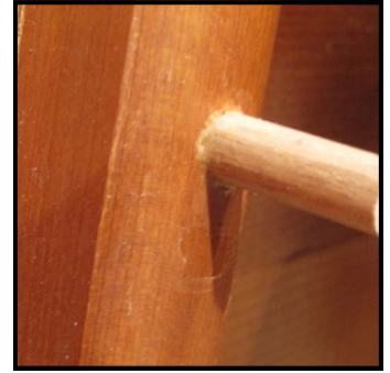
Dowel inserted in place.

In order to install toggles, 1/4" holes are drilled through the rib and soundboard at regular intervals from one end of the separation to the other. Woodworking glue is then worked into the space between the rib and the soundboard so that when the toggles are inserted and tightened down, the clamping action of the toggles produces a tight bond.