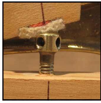
Note at rest