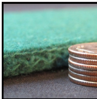
Back rail cloth

As the keybed felts harden and wear thin the keys become uneven in height from note to note. Also the amount of downward stroke (key dip) begins to vary, resulting in an action which has an uneven touch. A perfectly level set of keys with a uniform amount of key dip is essential to a piano action which is performing up to its potential.