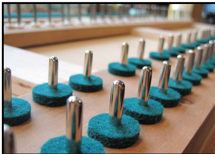
New set of keybed felts in place.

Keybed felts come in a range of thicknesses, so that the original size of the felt installed at the factory may be duplicated. Paper and card punchings as thin as .002" are used under the felts for final adjustments necessary for level keys and even key dip.