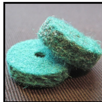
Front rail punchings

The felt used for backrail cloth, as well as the balance rail and front rail punchings, is a very thick, dense felt that is designed to stand up to decades of constant use.